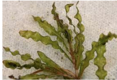
Curly Leaf Pondweed