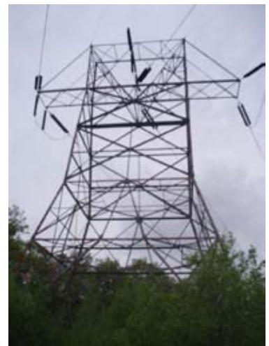
Twice as tall as this???

We will report further at the June meeting.