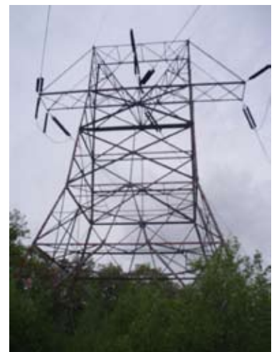
Twice as tall as this???

http://parkplanning.nps.gov/projectHome.cfm?projectID=25147 http://newjersey.sierraclub.org/PressReleases/0214.asp www.stophelines.com/